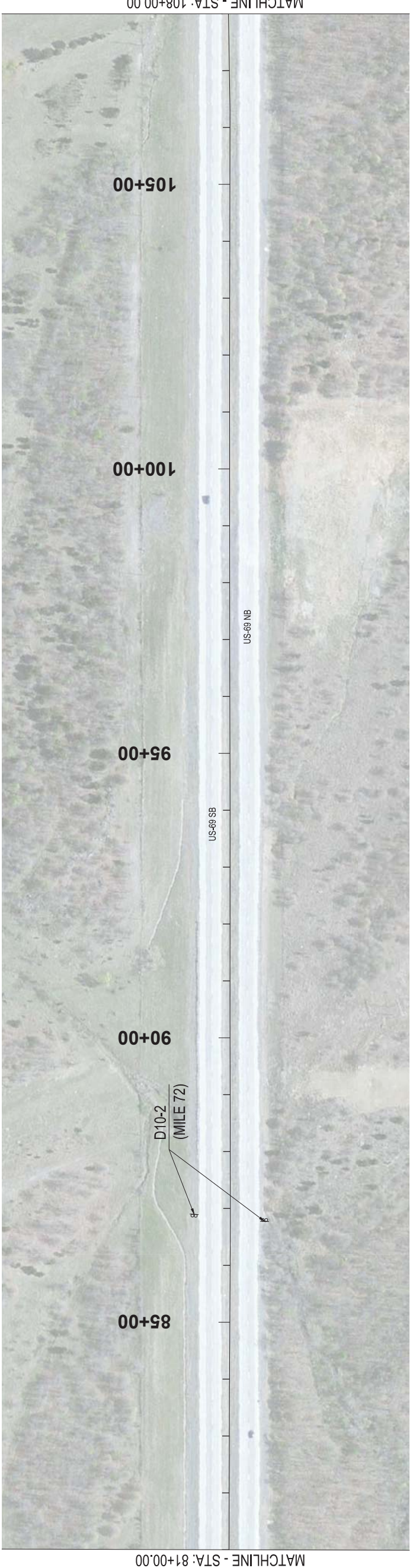
MATCHLINE - STA: 81+00.00