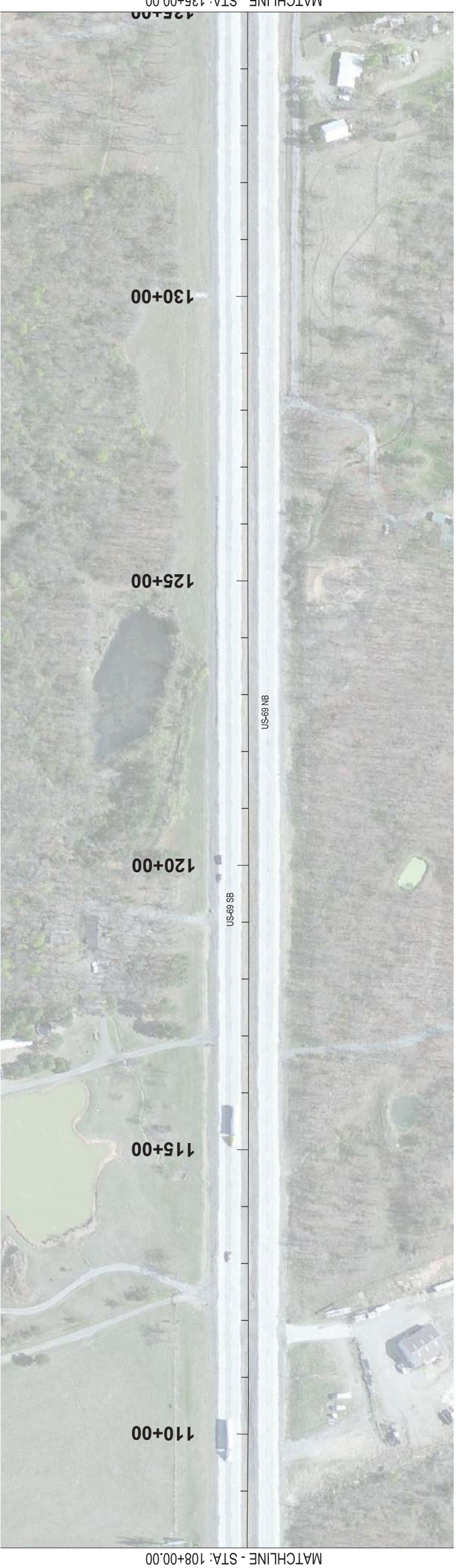
MATCHLINE - STA: 135+00.00